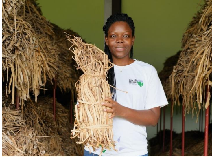
GREEN KEEPER AFRICA